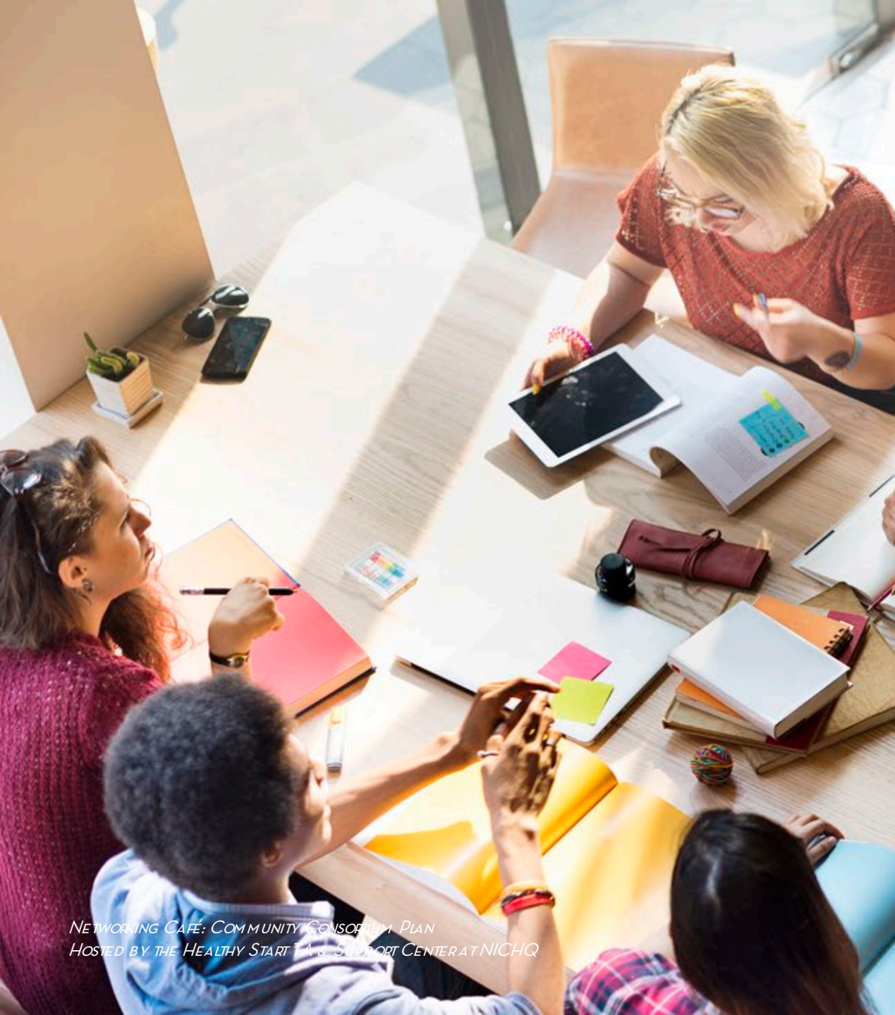
NETWORKING CAFÉ: COMMUNITY CONSORTIUM PLAN HOSTED BY THE HEALTHY START TA & SUPPORT CENTER AT NICHQ